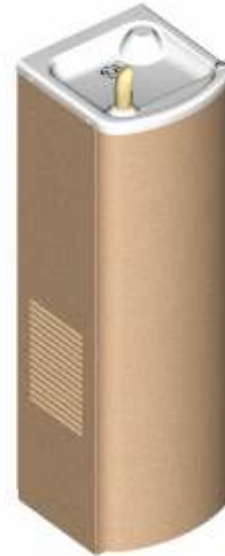
Model A511105F Shown